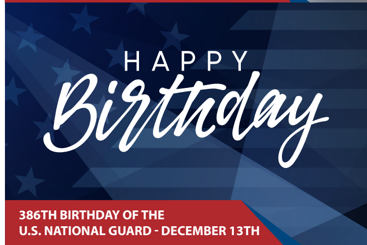
386TH BIRTHDAY OF THE U.S. NATIONAL GUARD - DECEMBER 13TH