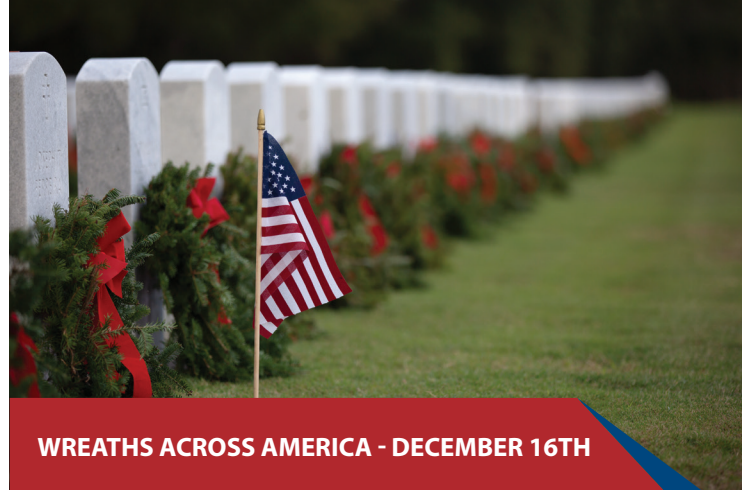
WREATHS ACROSS AMERICA - DECEMBER 16TH

Be sure to test your smoke detectors and carbon monoxide sensors twice a month. We recommend doing this every payday, so you do not forget.