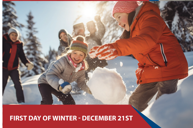
FIRST DAY OF WINTER - DECEMBER 21ST