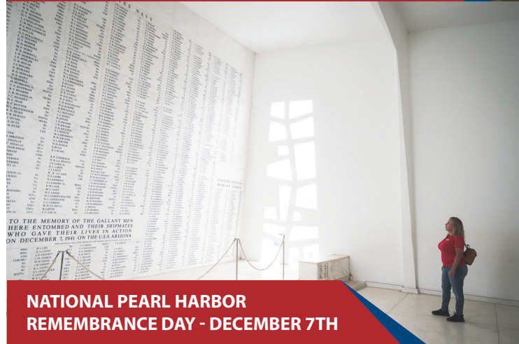
NATIONAL PEARL HARBOR REMEMBRANCE DAY - DECEMBER 7TH