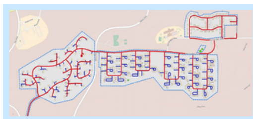
Douglass Valley Snow Removal Route

This information will also be shared on our social pages and email blasts when weather events occur. Please be sure to have updated contact information and click the link to follow our Facebook page!